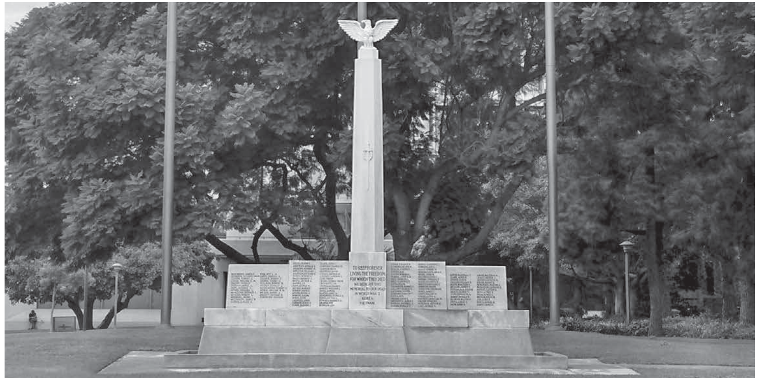
On a small, grassy plaza at Inglewood's City Hall stands the Memorial Obelisk Monument. Supported by a stone panel at its middle, the memorial is engraved with the phrase, "To keep forever living the freedom for which they died. We dedicate this memorial to our dead in World War II, Korea and Vietnam." The names of those who perished are on either side of the memorial. In the middle is a column with a sword and wreath, and on top, an eagle.